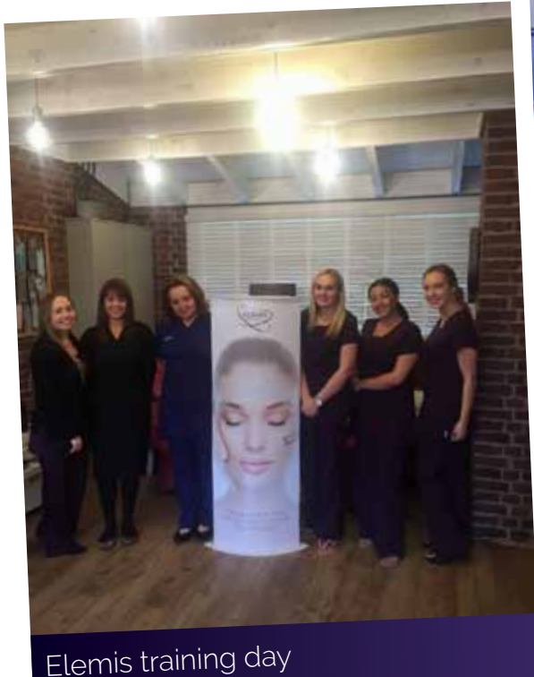
Elemis training day