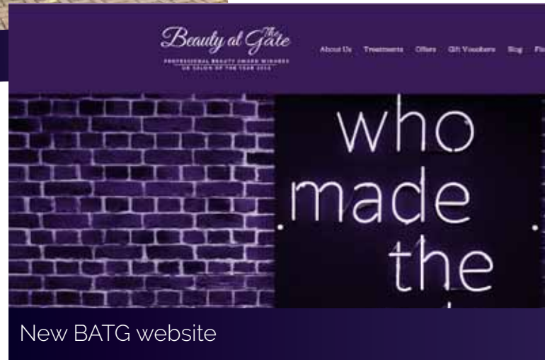
New BATG website