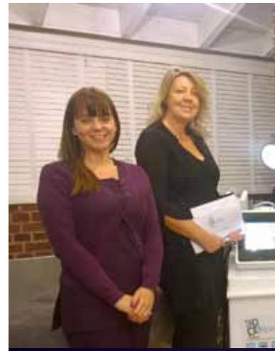
3D Lipo launch event