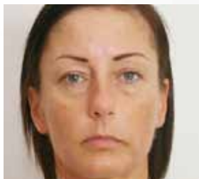
After 10 Treatments

In other words, A-Lift helps to recharge the batteries in your skin cells which over time have lost energy and that youthful look. The result is loss of volume as the muscles in the face, neck and jaw start to sag.